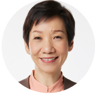
Ms Grace Fu Minister for Sustainability and the Environment

Ms Grace Fu is the Minister for Sustainability and the Environment. Prior to her current appointment, she was the Minister for Culture, Community and Youth and held various positions at the Prime Minister's Office, Ministry of Foreign Affairs and Ministry of National Development. Ms Fu began her career with the Overseas Union Bank and was the Chief Executive Officer of PSA Southeast Asia and Japan before joining the public sector.