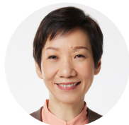
Ms Grace Fu Minister for Sustainability and the Environment